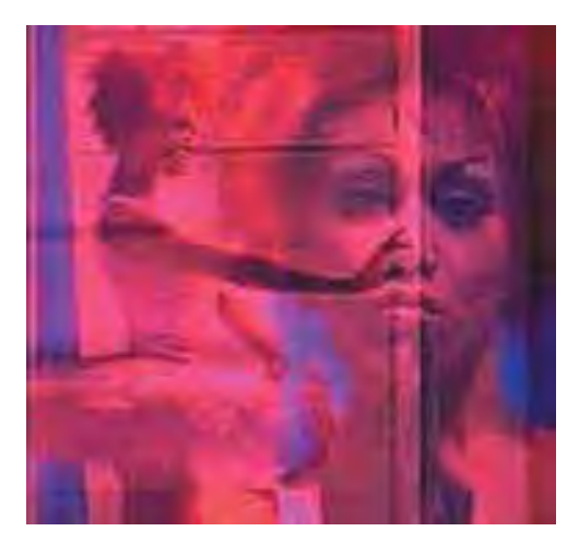
British American Tobacco marketing poster

In this case, BAT has being doing the opposite of what they are claiming in the 2003 report, and the claim is grossly deceptive. They have continued to use tobacco packaging that is highly attractive to youth. BATNZ have either allowed their brands to be used in New Zealand dance party promotions [54, 53] or appear to have sat on their hands while this was done by others. Their parent company has used motor racing sponsorship to make their brands attractive to youth [56-59] including those in New Zealand. BAT has deliberately targeted young people worldwide by linking their British American Racing team with the Lucky Strike brand and the Lucky Tribe merchandising [60]. The company has a recent history of actively marketing to youth around the world [61-66].