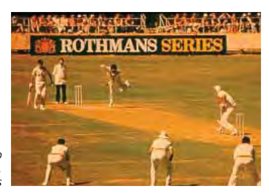
Prior to NZ banning tobacco sponsorship, NZ tobacco companies sponsored major sports events. http://tobaccodocuments.org/pollay_ads

Again on p.124, the report describes stakeholder concerns about "environmental problems and safety hazards generated by careless disposal of packaging and tobacco-related litter."